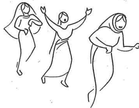
So they went out and ran. (16.8)

8 So they went out and ran from the tomb, distressed and terrified. They said nothing to anyone, because they were afraid.